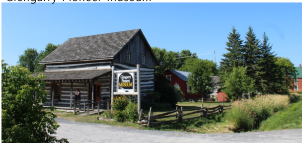
Glengarry Pioneer Museum