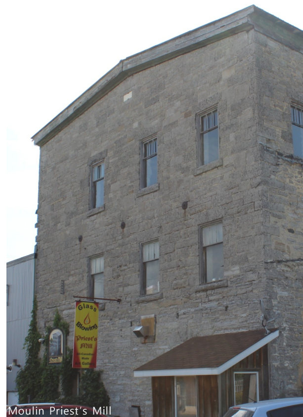
Moulin Priest's Mill

How to be included on the Municipal Heritage Register