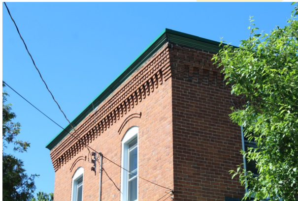
An ornate Brick Residence