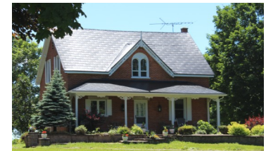
A Victorian-era Residence

You will need this information to complete the Request for Listing form, available online and at the Township office.