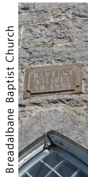
Breadalbane Baptist Church

A variety of architectural and historical factors can contribute to a property's cultural heritage