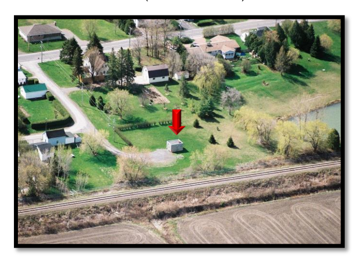
The Glen Robertson Wellhead in North Glengarry

Owned and operated by the Township of North Glengarry, the Glen Robertson well supplies a population of approximately 100. Located at 3342 Irwin Street in Glen Robertson, this drinking water system is one of 13 systems in the Raisin-South Nation Source Protection Region that use groundwater as a source of municipal drinking water. There are 13 other systems that use surface water (rivers and lakes).